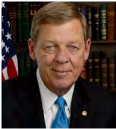
Johnny Isakson U.S. Senator