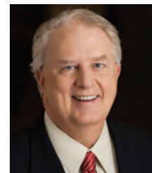
Roy Barnes 80 TH Governor of Georgia